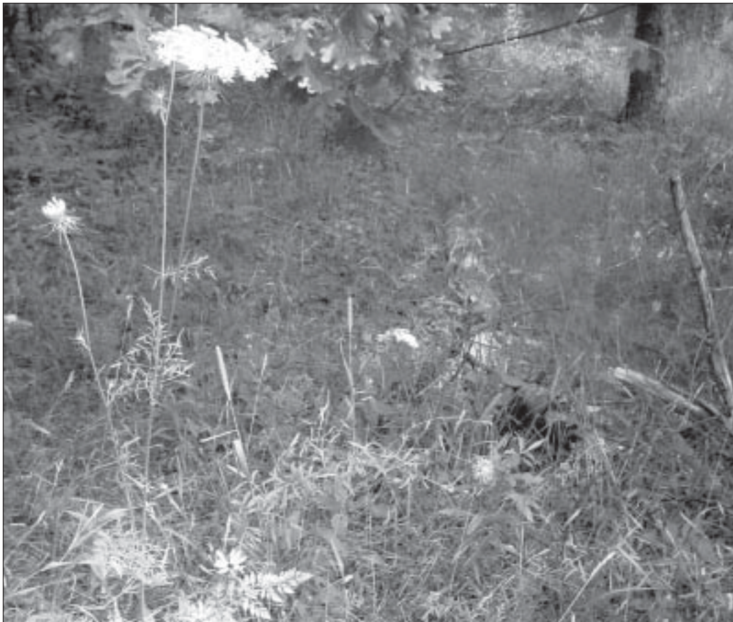
With a gift from Janice Harwood, Kettunen Center is able to enhance its arboretum and develop a self-guided interpretive trail featuring Michigan native trees, shrubs and wildflowers. Above is a cluster of black-eyed Susans, Queen Anne’s lace, spotted knapweed and goldenrod, wildflowers in the arboretum.

The arboretum and trail enhancements are part of the Kettunen Center Wildlife Habitat and Forest Management Plan which was developed in 1991 by Jay Snyder, wildlife biologist with the Forest Wildlife Project. The plan has been used periodically to selectively plant shrubs or trees, place and maintain nesting boxes, manage invasive plant species, develop self-guided trails, and provide wildlife viewing areas and signage.